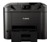
MAXIFY MB5450 series